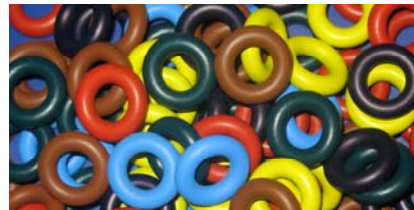
PAI offers six T-Coat™ colors

T-Coat™ PTFE coatings in varied colors may be applied to the seal surface. In addition to providing identification, T-Coat™ coatings provide lubrication; beneficial for automated assembly operations.