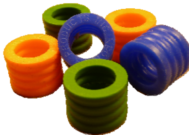
Custom Seals made using three colors to identify end user products

Colored Compounds may be used to distinguish different compounds or different (end user) products. The items at right are all made from essentially the same compound - only their color is different. The manufacturer uses the colors to identify product model sizes.