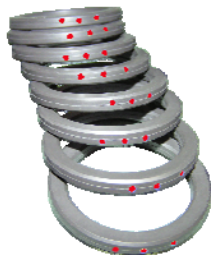
Custom Seals with Three Red Dots

Painted marks are applied as dots or lines to identify different compounds. Most manufactures develop their own systems using different colors and numbers of markings.