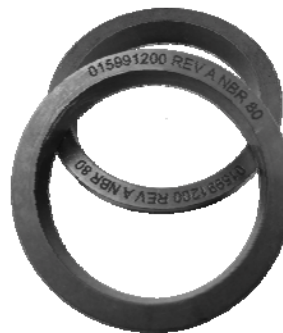
Detailed P/N Laser Engraved