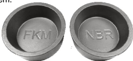
ASTM Polymer Designation engraved into Piston Cups to prevent mix-up in assembly

Unlike most mold engraving, laser engraving does not extend out from the parts, allowing heel of lip seals to be marked.