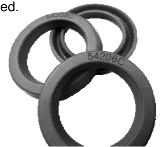
Batch Number Laser Engraved into Heel of U-Cup

After 57 years in the rubber business, we've learned to be flexible. We'll bend over backwards to design custom solutions that meet your needs precisely . PAI is the company you can trust for rubber seal solutions YOUR WAY!